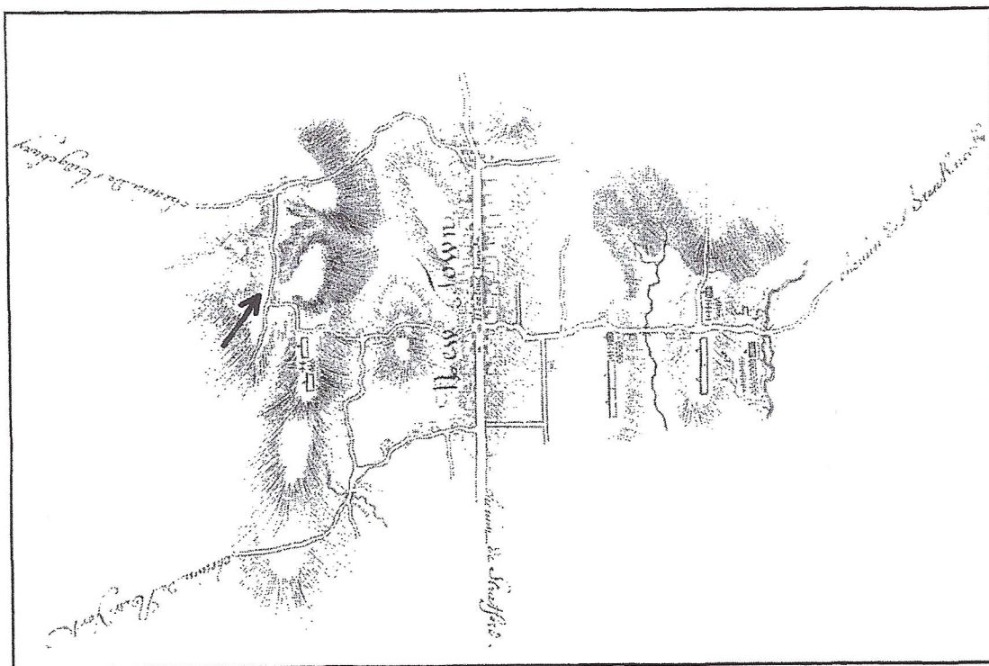
Figure 2: Newtown camps, as drawn by Louis-Alexandre Berthier, military engineer for the French army, with the portion of the route along Reservoir Road indicated by an arrow ( from Rice and Brown 1972 ).