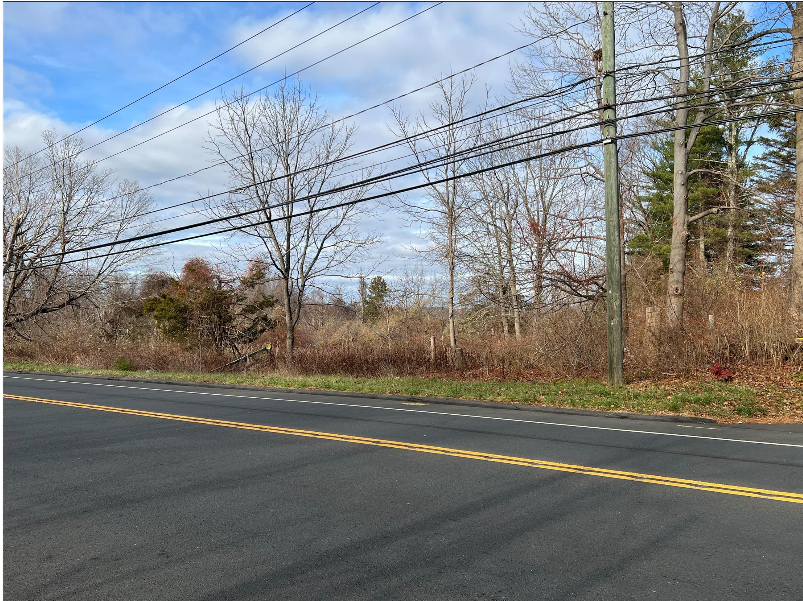
VIEW NO. 2 - EXISTING