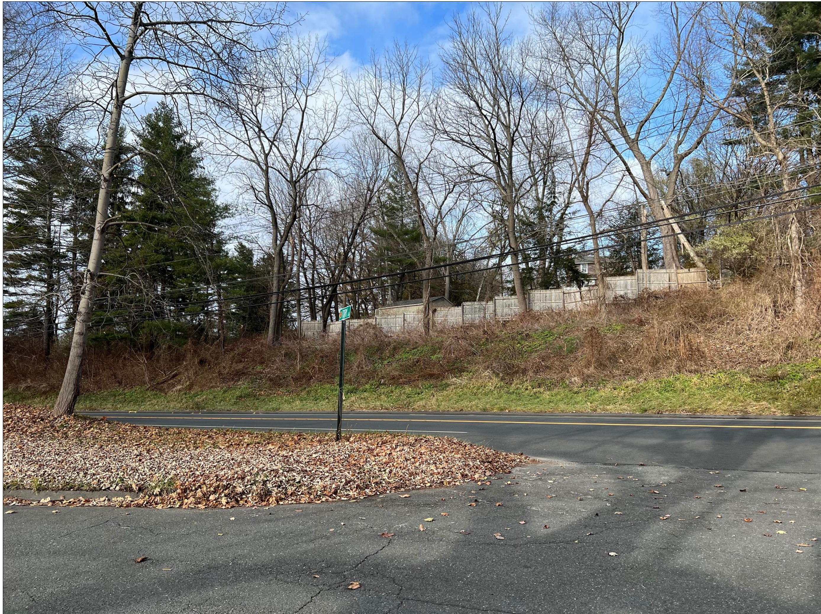
VIEW NO. 3 - EXISTING