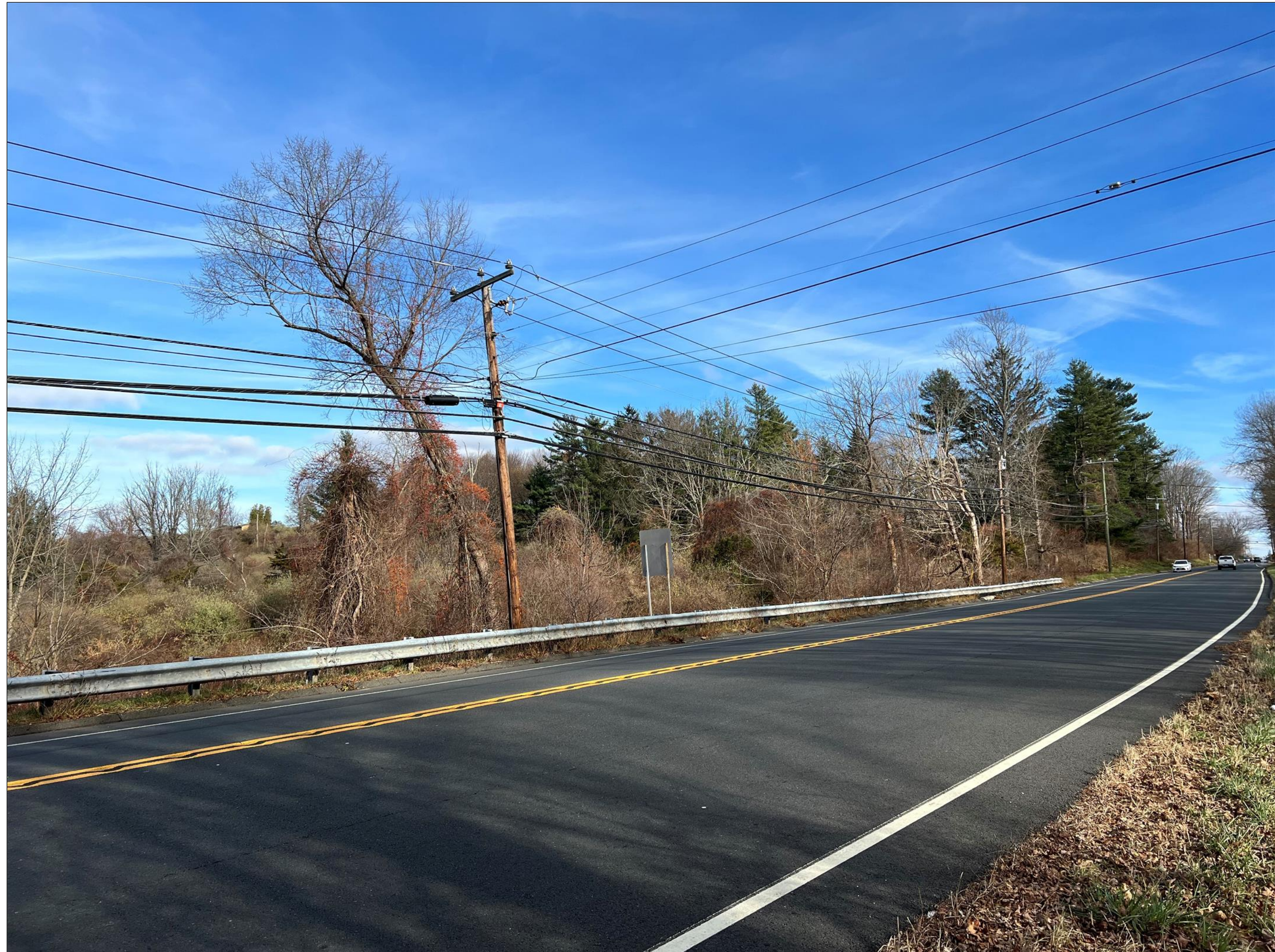
VIEW NO. 1 - EXISTING