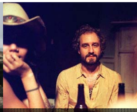
PHOSPHORESCENT +80K FOLLOWERS