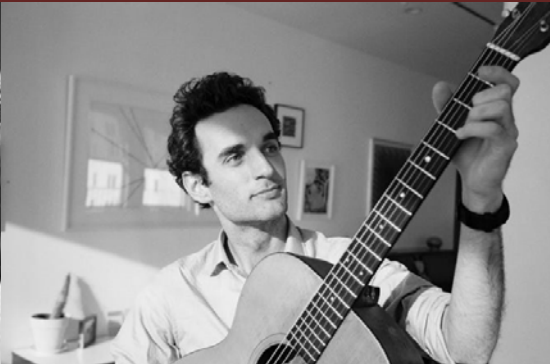
JULIAN LAGE +50K FOLLOWERS