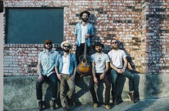
QUIET LIFE +10K FOLLOWERS