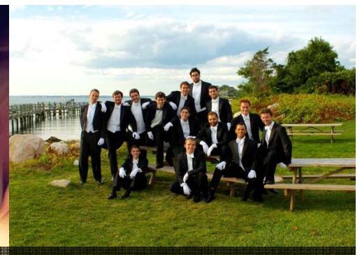
YALE WHIFFENPOOFS +10K FOLLOWERS