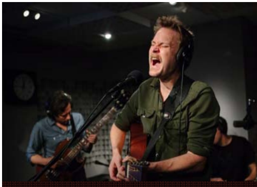
HISS GOLDEN MESSENGER +30K FOLLOWERS