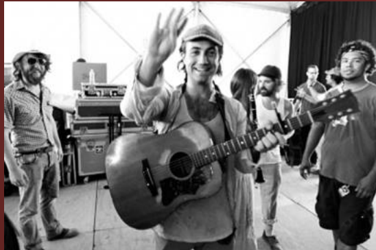
THE LOW ANTHEM +33K FOLLOWERS