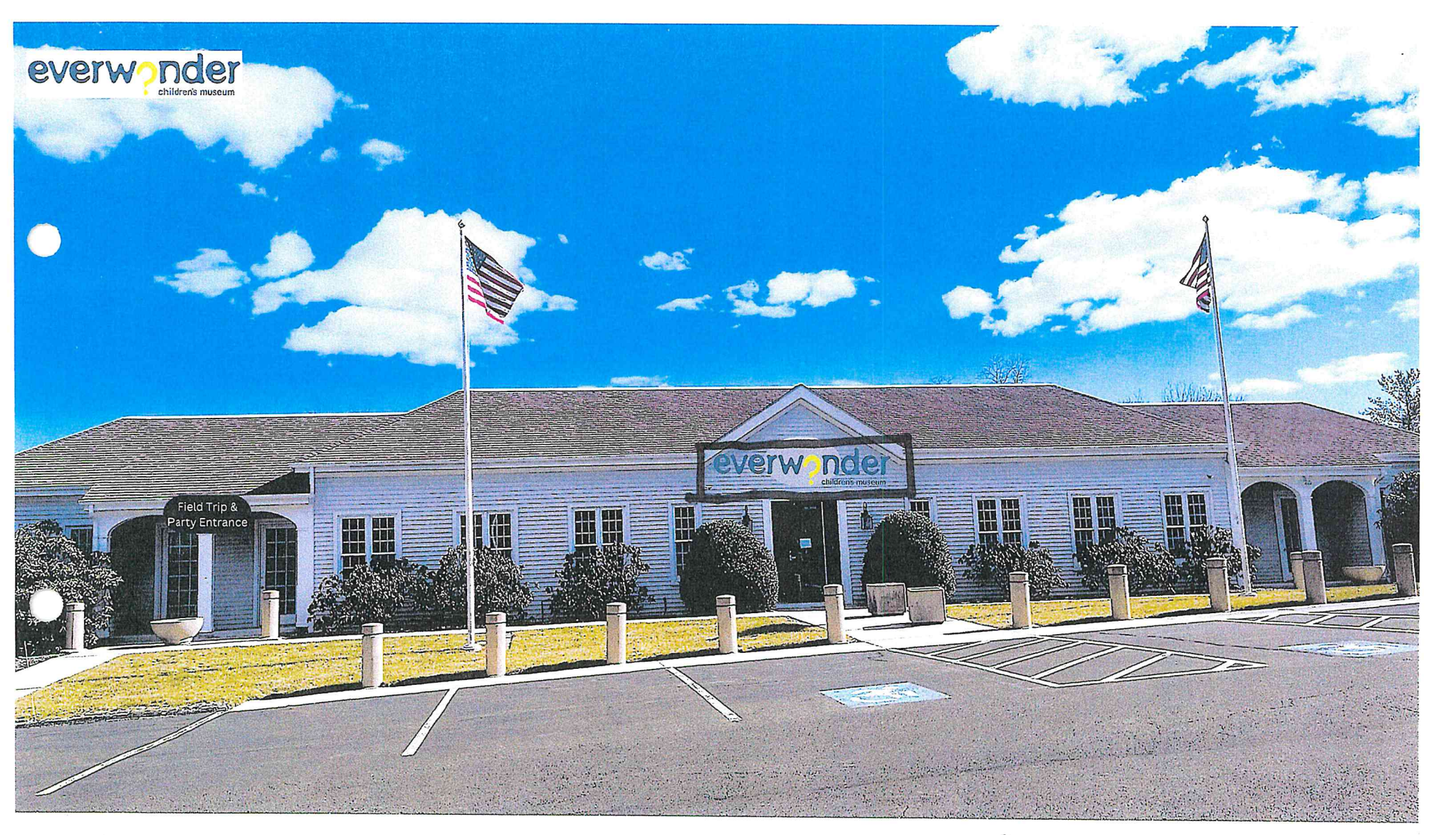
MAIN ENTRANCE SIGN