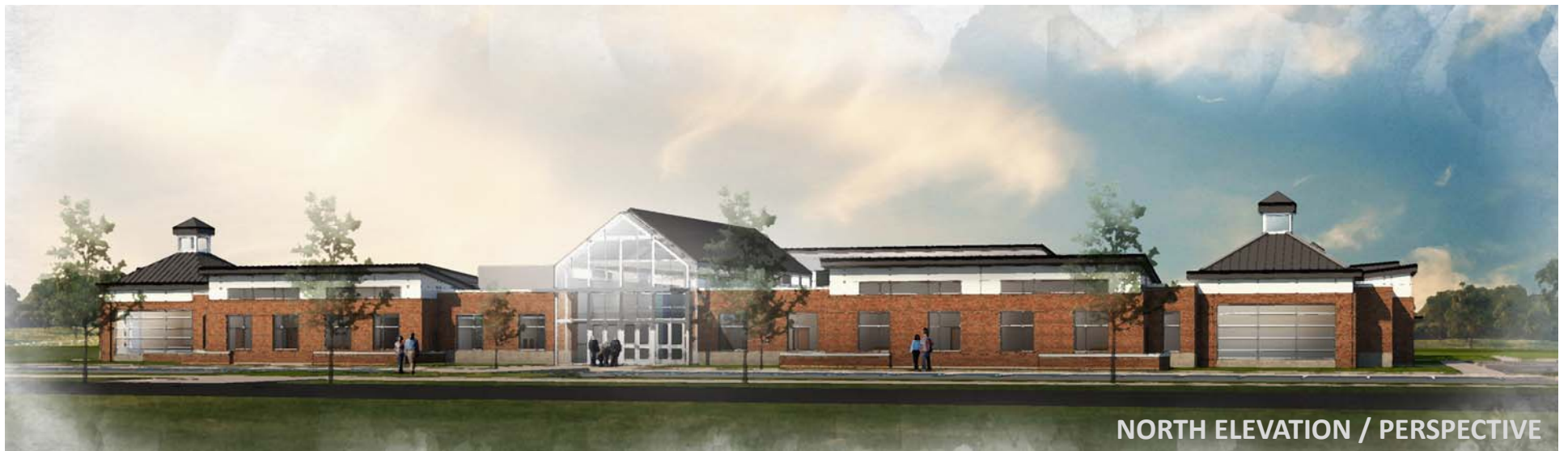
NORTH ELEVATION / PERSPECTIVE