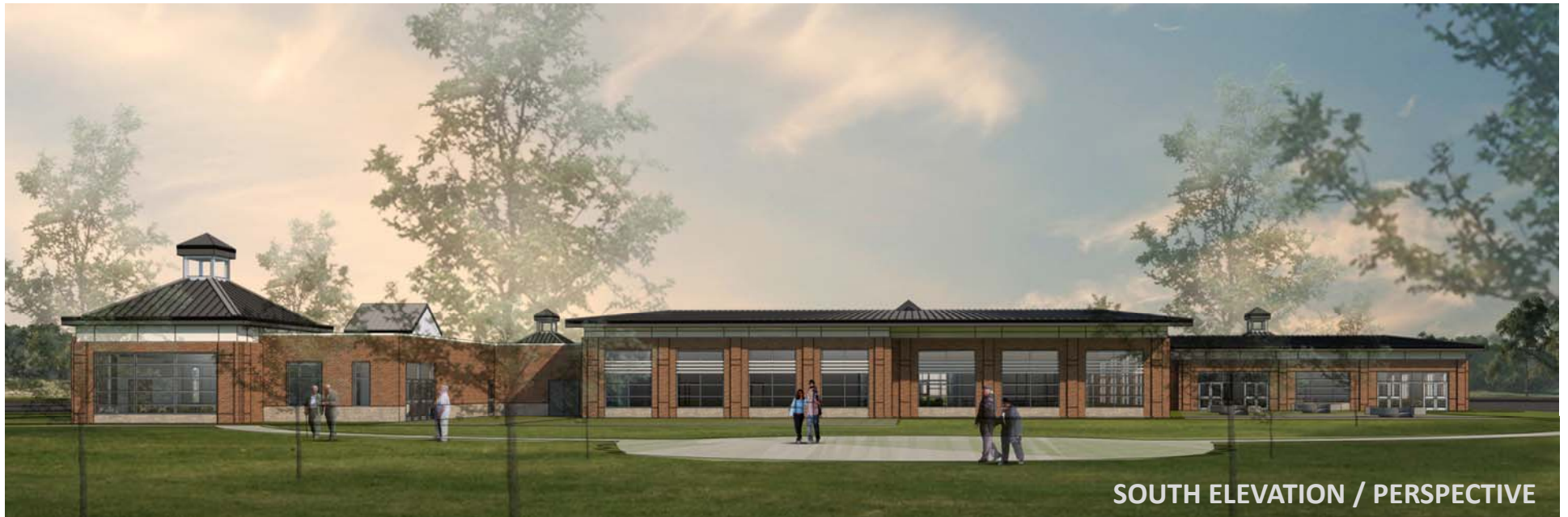
SOUTH ELEVATION / PERSPECTIVE