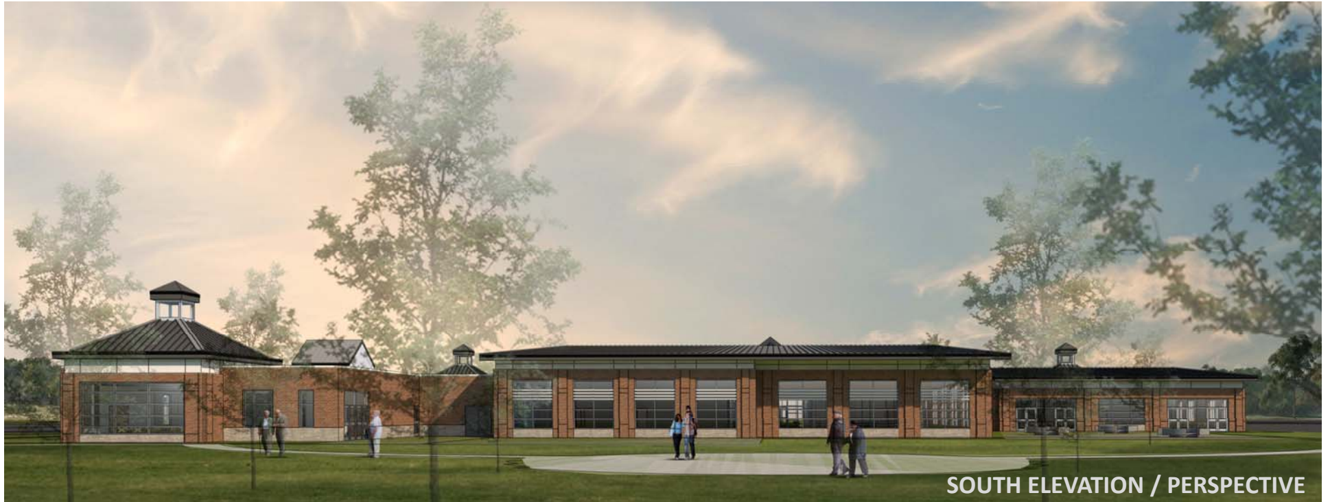
SOUTH ELEVATION / PERSPECTIVE