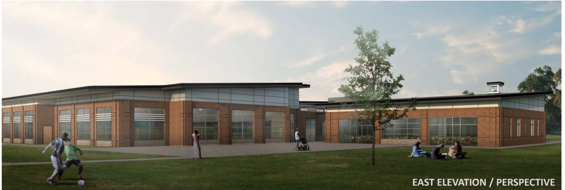
EAST ELEVATION / PERSPECTIVE