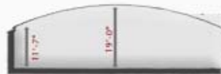
typ. dining hall section