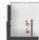
typ. dishwash'g section