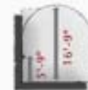
typ. lobby section