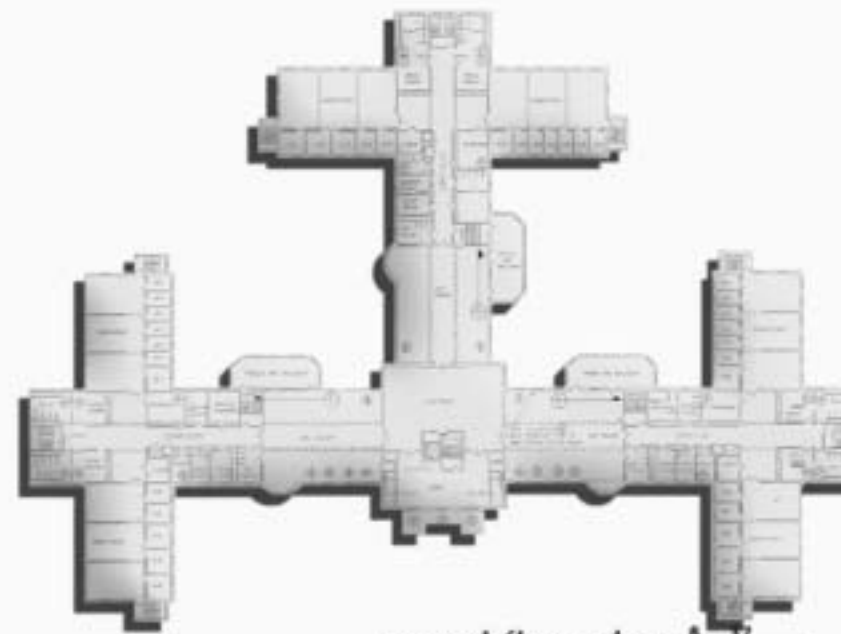
second floor plan