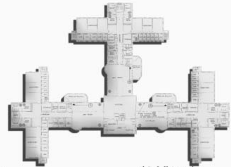
third floor plan