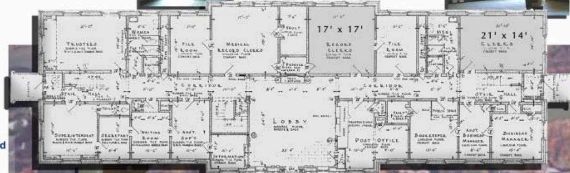
first floor plan