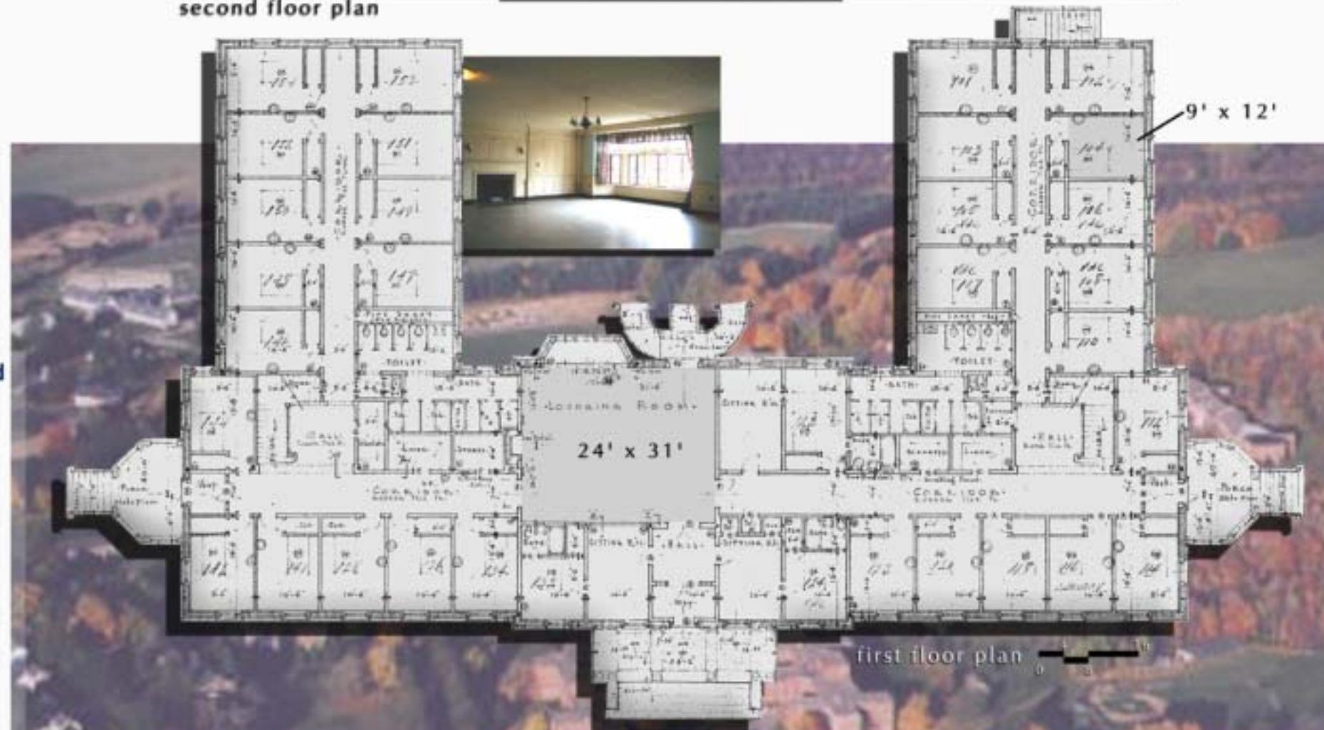
first floor plan